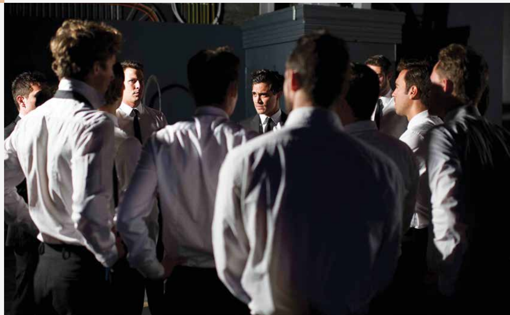
TYPE Event Waiters / Boardroom Waiters