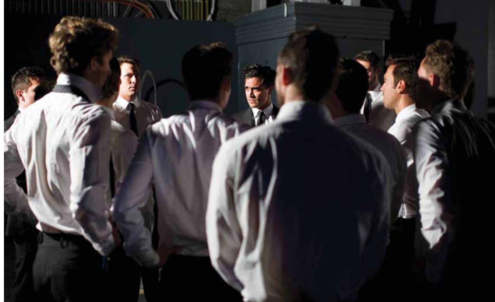
TYPE Event Waiters/ Boardroom Waiters